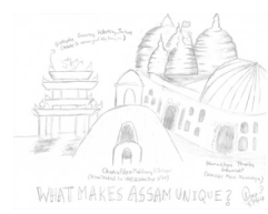
Sonakshee Phukan (12 yo) D/o Shrutimala & Shivajit Phukan, Troy, MI