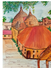
Prakash Jyoti deka (22 yo) Darrang, Assam