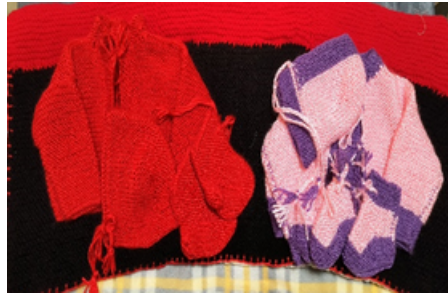
DONATIONS FOR WEAVING FOR CARE PROGRAM - 2024